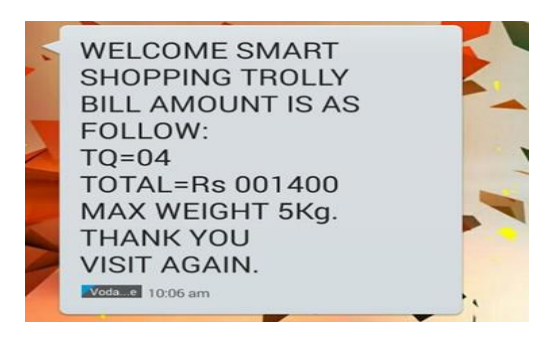
FIG 3: OUTPUT IN THE FORM OF MESSAGE

The customer receives a message in which the details of shopping is given. It helps the customer and even the trader to deal quickly and save their time.